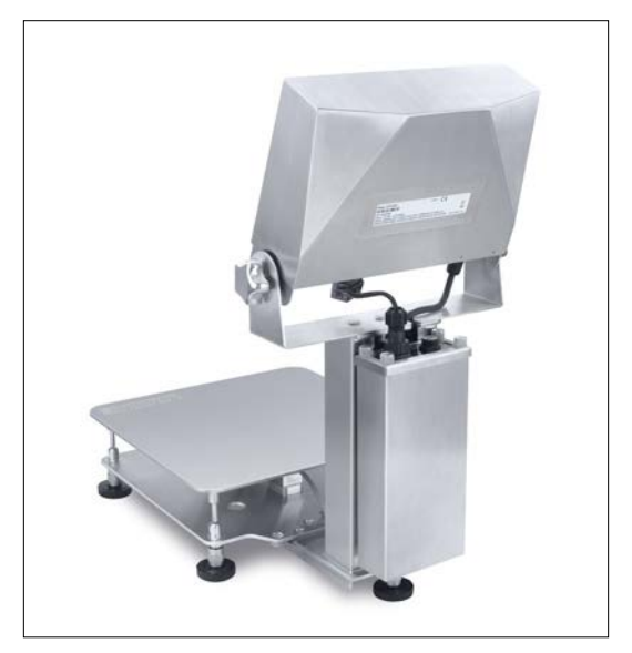
Optional External Power Bank Holder for i-D61XWE Models